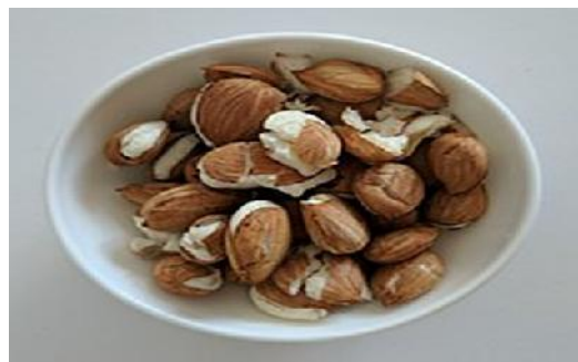
Fig 2: Dried apricots

An apricot kernel is the seed of an apricot. It is known for containing amygdalin, a poisonous compound. Together with the related synthetic compound laetrile, amygdalin has been marketed as an alternative cancer treatment. However, studies have found the compounds to be ineffective in the treatment of cancer, as well as potentially toxic or lethal when taken by mouth, due to cyanide poisoning. Fresh and dried apricots also contributes to their effect on blood sugar for some individuals. Vitamin E functions as an antioxidant, and a diet rich in antioxidants helps improve blood sugar levels for people suffering from Type 2 diabetes, explains the University of Maryland Medical Center.