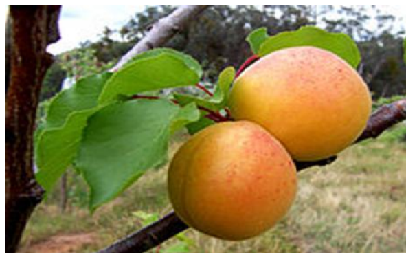
Fig 1: Prunus armeniaca

Prunus Armeniaca: Prunus armeniaca ("Armenian plum"), the most commonly cultivated apricot species, also called ansu apricot, Siberian apricot, Tibetan apricot, is a species of Prunus , classified with the plum in the subgenus Prunus . The native range is somewhat uncertain due to its extensive prehistoric cultivation, though almost certainly somewhere in Asia. It is extensively cultivated in many countries and has escaped into the wild in many places.