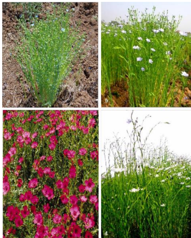
Figure 2: Plant types in respect to height and colour of flower; a. Bushy (Bushy branching); b. Semi erect (Lateral Branching); c. Red colour flower of linseed with Semi erect (Lateral Branching); d. Long erect (top branching)