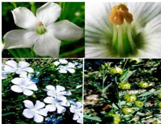
Figure 4: Flowering and fruiting of linseed plants; a. Individual flower with five petals; b. Fused stamens; c. Number of flowers in a plant; d. Capsules bearing seeds of Linum usitatissimum L. plant