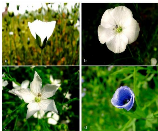
Figure 3: Shape of flower; a. Funnel shape; b. Disc shape; c. Star shape; d. Tubular