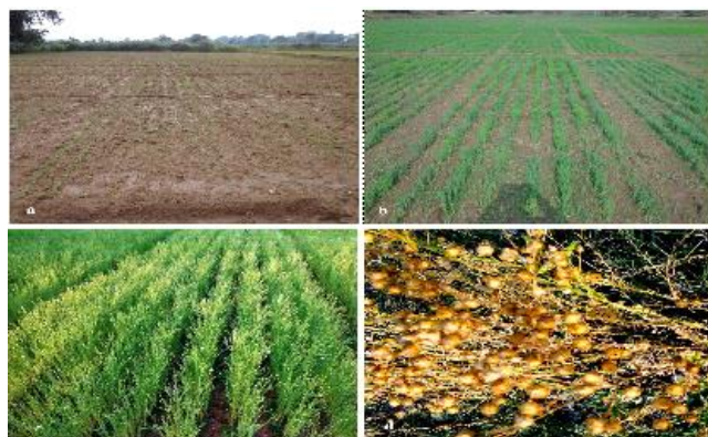
Figure 5: Field preparation and cultivation; a. Field shows pre-seed germination/starting of seed germination; b. Seedling stage observed from field; c. Linseed plants

bearing a number of flowers in the erect branches. d. Matured capsules ready to harvest