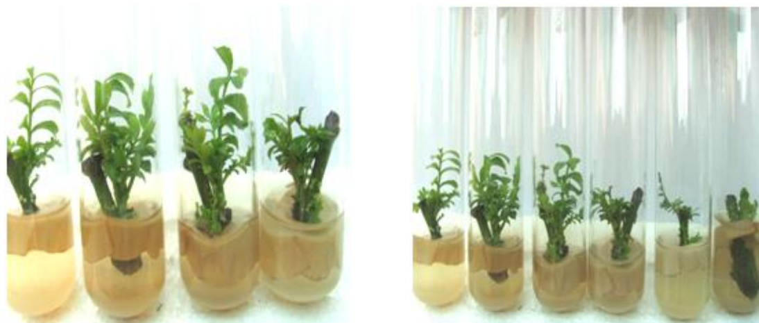
Figure 8. In vitro multiple shoot induction from axillary bud explant on MS (liquid) with BAP (11.09 \mu M) + Kinetin (11.61 \mu M) + ADS (81.44 \mu M)