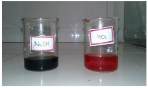
Figure 2: Extract in acidic and basic media