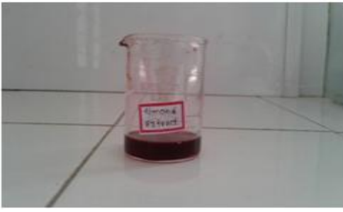
Figure 1: Almond Exocarp Extract

The color of natural indicators, P^{H} , color changes in acid and base are indicated in Table no 1 figure 1&2. The extract was scanned in the visible region from 400-600 nm. The spectra was given in figure.3 .The color changes obtained in neutralization titrations with different Titrants and titrates of 0.1M are given in Table no-2. The titer values in comparison with synthetic indicator are given in Table no-3. For all types of titrations, equivalence point obtained by the Methanolic extract of Almond exocarp extract are very close with equivalence point obtained by standard indicator .This represents the usefulness of the extract as an indicator in acid-base titrations. The use of Almond exocarp extract in strong acid- strong base and weak acid – strong base titrations was found to be more significant as it gives sharp color change at equivalence point.